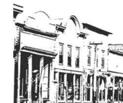
A NEBRASKA MAIN STREET COMMUNITY

Business Improvement District #5 P. O. Box 1486 Grand Island, NE 68802 www.downtowngi.com 308-382-9210